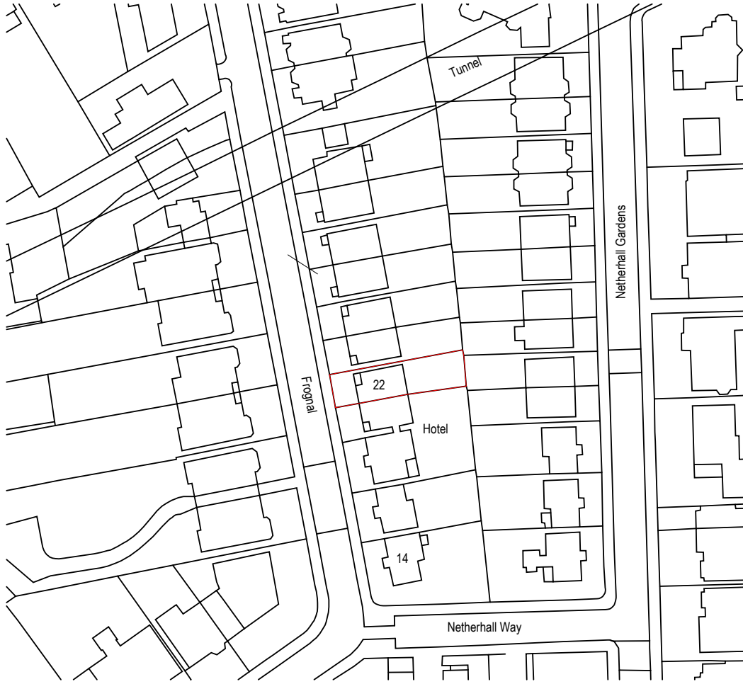
1 Site Location Plan 1 : 1250