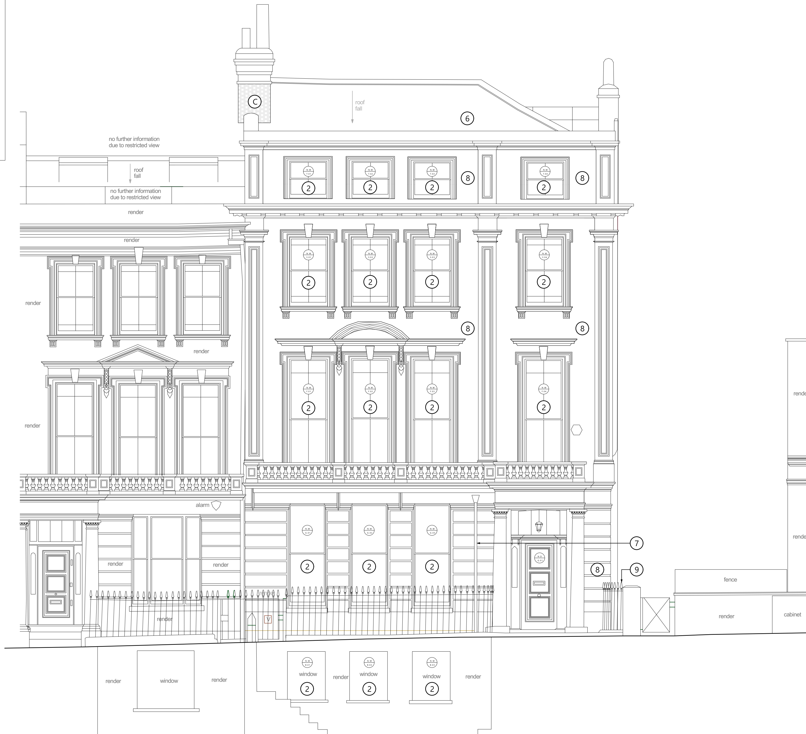
1 Proposed North West (Front) Elevation Scale: 1:50