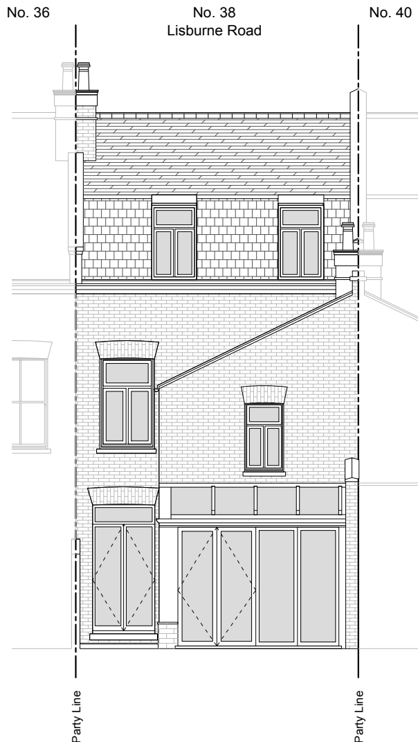
00 REAR FACADE - EXISTING SCALE: 1:100 @ A3