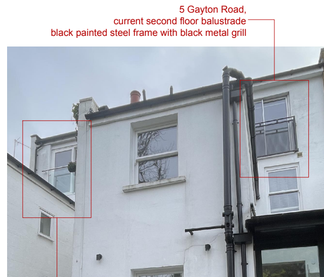
5 Gayton Road, current second floor balustrade black painted steel frame with black metal grill