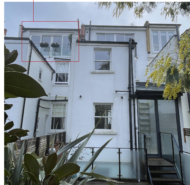
7 Gayton Road glass balustrade stainless steel supports