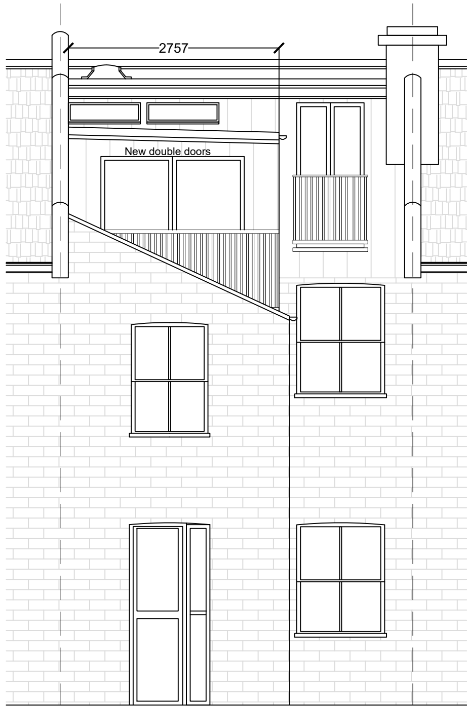
02 PROPOSED BACK ELEVATION 1:50