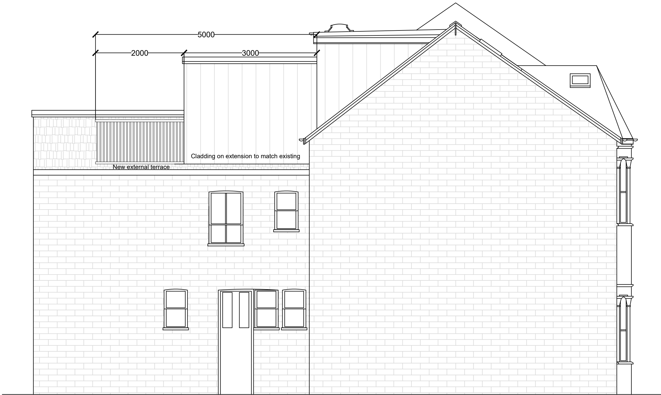
01 PROPOSED SIDE ELEVATION 1:50