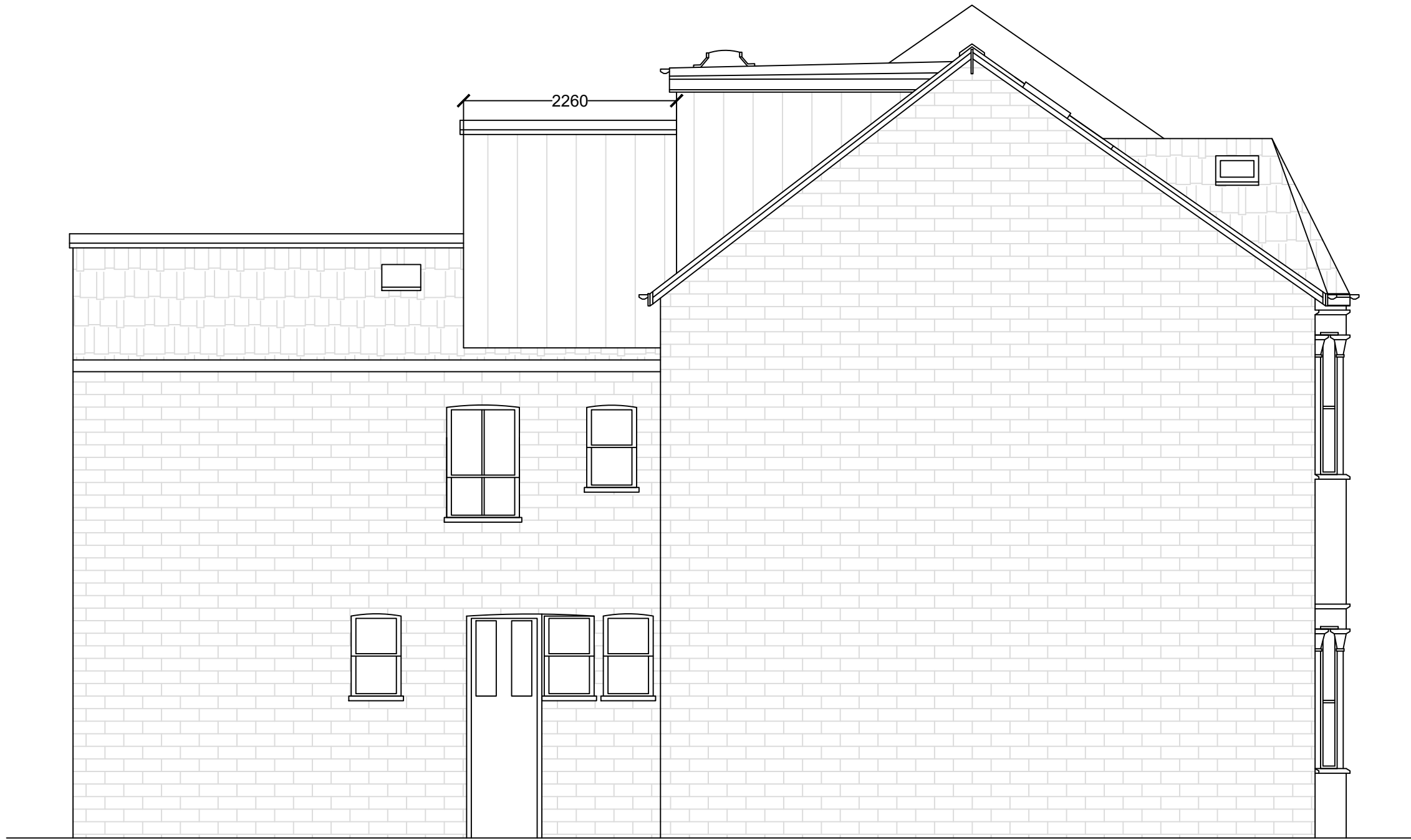
01 EXISTING SIDE ELEVATION 1:50