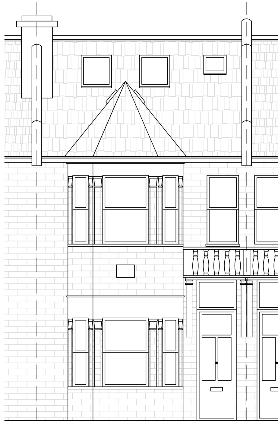
04 EXISTING FRONT ELEVATION 1:50