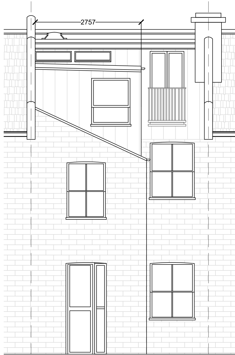
02 EXISTING BACK ELEVATION 1:50