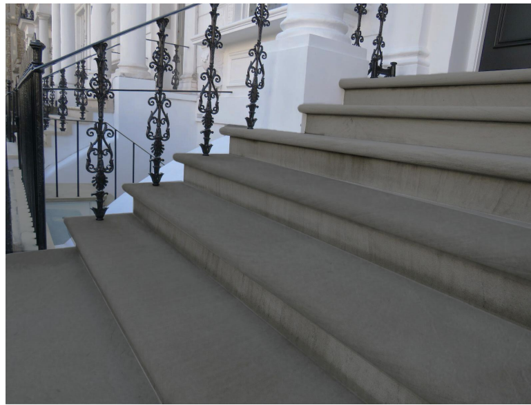
Brazilian Grey Slate steps

notes Do not scale this drawing. Drawing to be read in conjunction with relevant structural, mechanical, electrical and furniture drawings. All dimensions to be verified on site prior to making shop drawings or executing the works. SPATIAL AGENT to be immediately advised of any discrepancy between this drawing and site conditions. All works to be in accordance with local authority's and landlord's requirements. This drawing is protected by Copyright. It may not be reproduced in any form or by any means for any purpose, without gaining prior written permission from SPATIAL AGENT