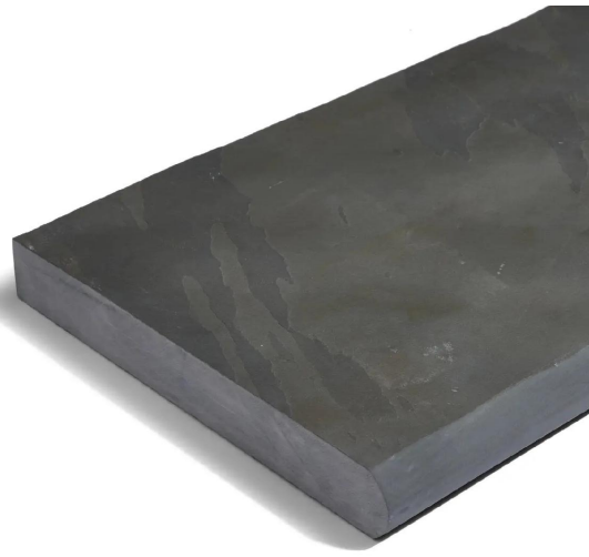
Brazilian Grey Slate Bullnose step