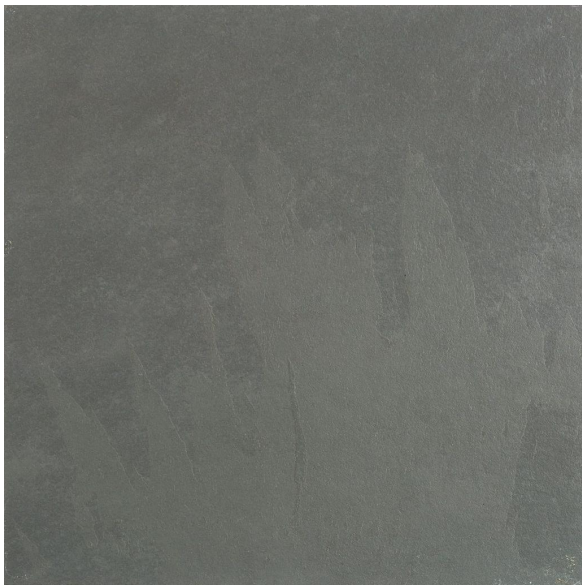
Brazilian Grey Slate Paving